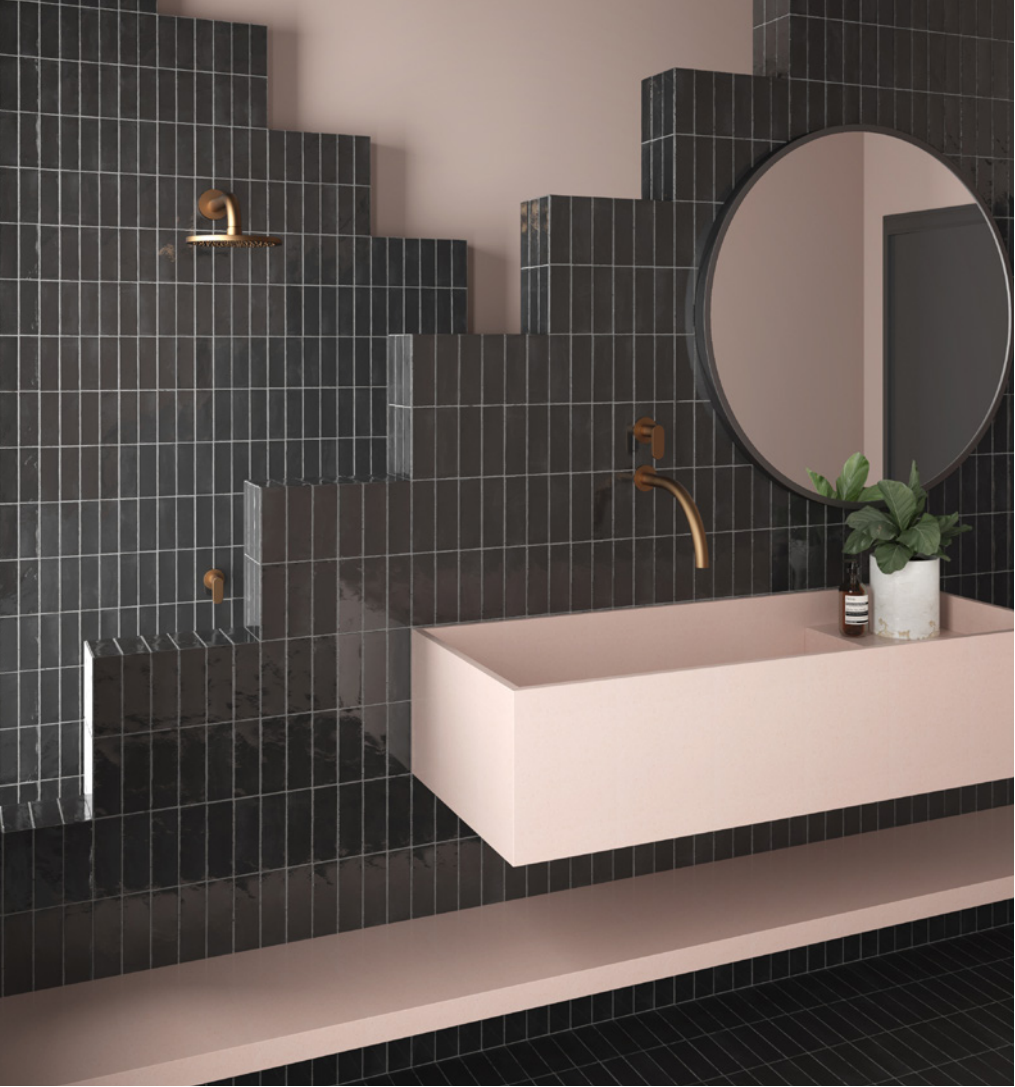
Variation is an inherent property of tiles and stone. Sizes are nominal and may include a joint.